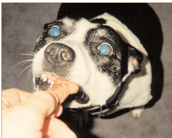
Green-eyed cookie monster

When played intelligently, physical games, such as play-fighting and tug-of-war, are effective bite inhibition and control exercises, and are wonderful for motivating adult dogs