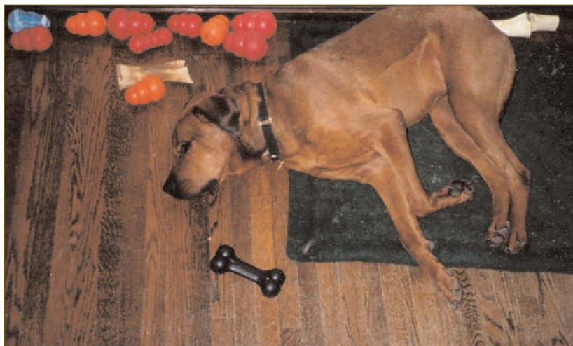
Claude Konged—peacefully passing the time when left at home alone (after chewing himself to sleep)

Give your puppy plenty of toys whenever leaving him on his own. Ideal chewtoys are indestructible and hollow (such as Kong products or sterilized longbones), as they may be